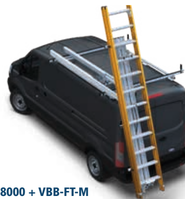
DPS-8000 + VBB-FT-M