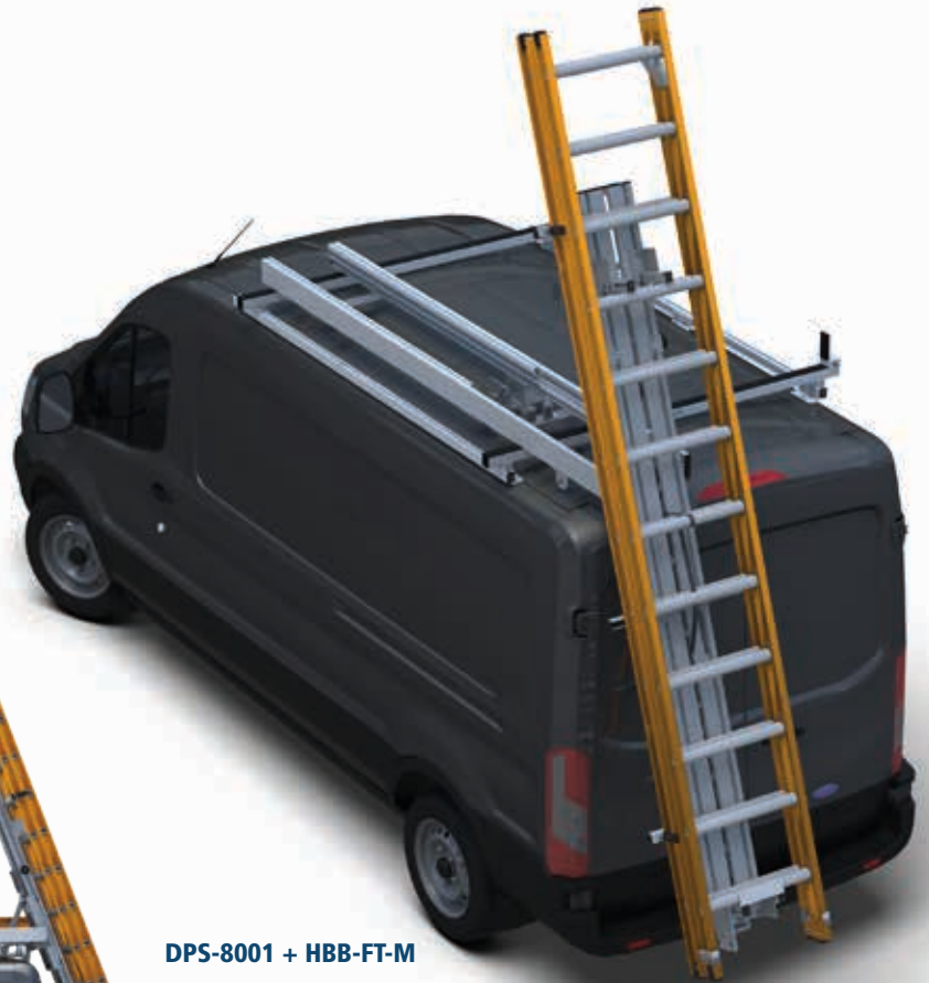
DPS-8001 + HBB-FT-M

The system's deploying and stowing features are ergonomic and help to protect operators from muscle stress, strain and fatigue. Get your fleet or business started today on the road to safety and productivity.