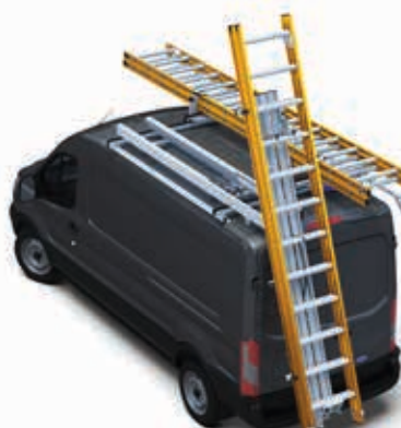
DPS-8001 + HBR-E-FT-M