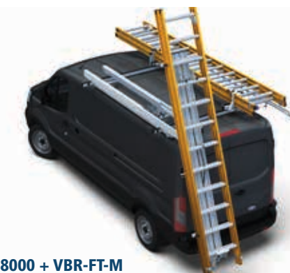
DPS-8000 + VBR-FT-M