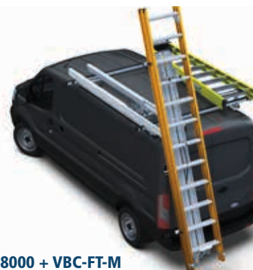
DPS-8000 + VBC-FT-M