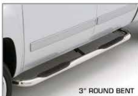
3" ROUND BENT