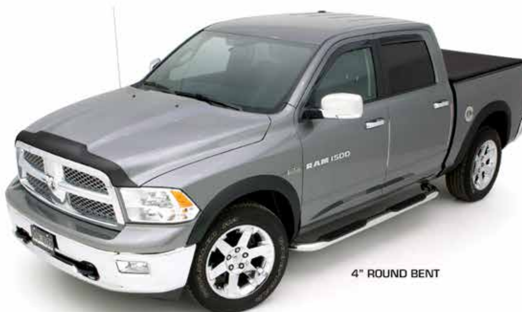
4" ROUND BENT