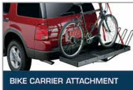
BIKE CARRIER ATTACHMENT