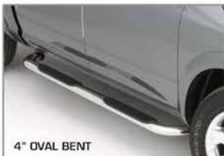
4" OVAL BENT