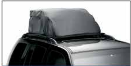
AERO ROOFTOP BAG