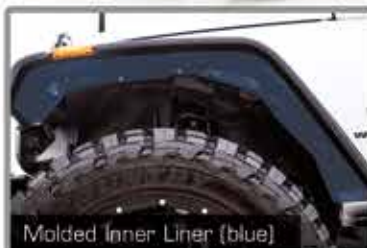
Molded Inner Liner (blue)