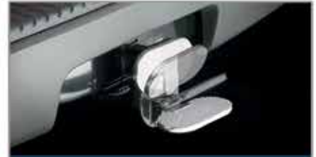
HITCH STEP universal