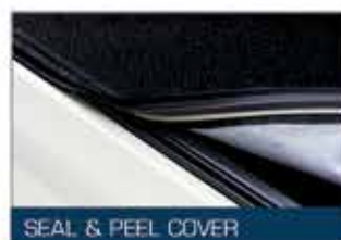
SEAL & PEEL COVER