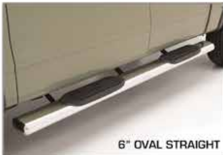
6" OVAL STRAIGHT