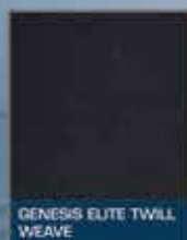
GENESIS ELITE TWILL WEAVE