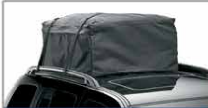
SOFT PACK ROOFTOP BAG