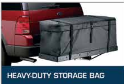
HEAVY-DUTY STORAGE BAG