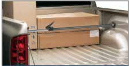
RATCHETING CARGO BAR