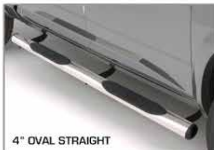
4" OVAL STRAIGHT