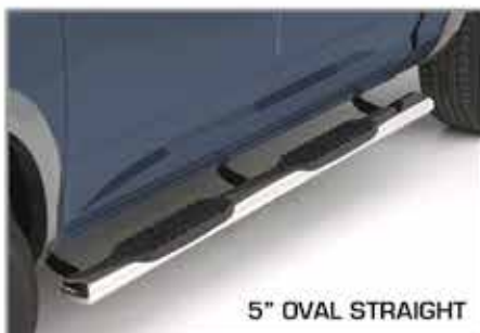
5" OVAL STRAIGHT