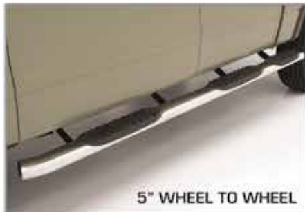
5" WHEEL TO WHEEL