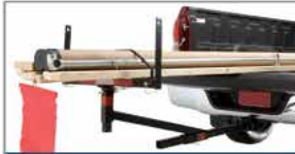
HITCH RACK BED EXTENDER