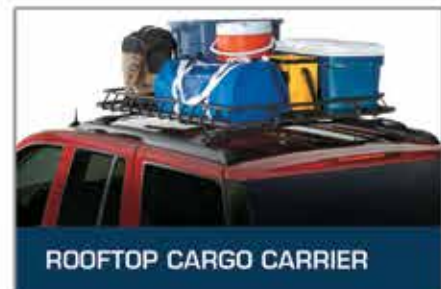
ROOFTOP CARGO CARRIER